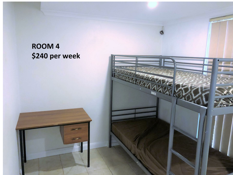
ROOM 4 $240 per week